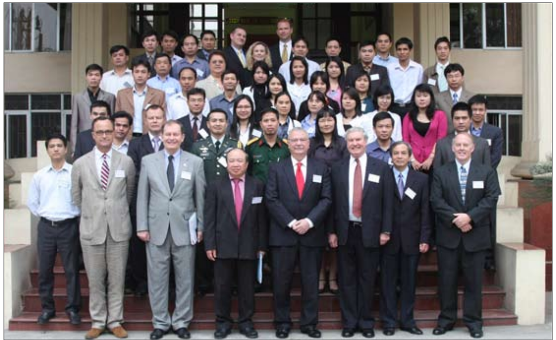
The workshop included nearly 50 attendees from the Vietnamese Ministry of Defense, Ministry of Public Safety and Ministry of Foreign Affairs, who are involved in peace operations.