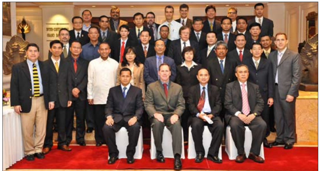
Course participants include CT experts and representatives from nine different Southeast Asian countries.