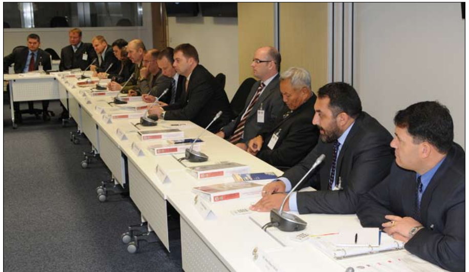
Twenty-seven Fellows participated in the workshop held in Garmisch.