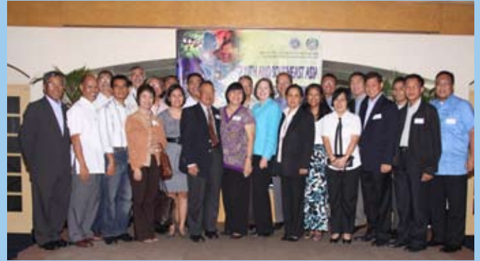
The APCSS Philippine Alumni Association with APCSS Faculty.

One workshop participant commented that “the APCSS experience really makes us proud to belong to a community of security practitioners seriously talking about diverse topics that impact on global security.” ■