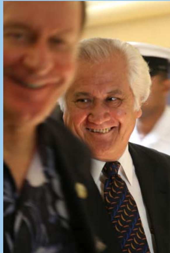
Dr. Feleti Sevele, Prime Minister of Tonga, visited APCSS Tuesday, January 22. It was his first visit to the Center which has hosted 30 Tongan military and senior civilians in APCSS programs.