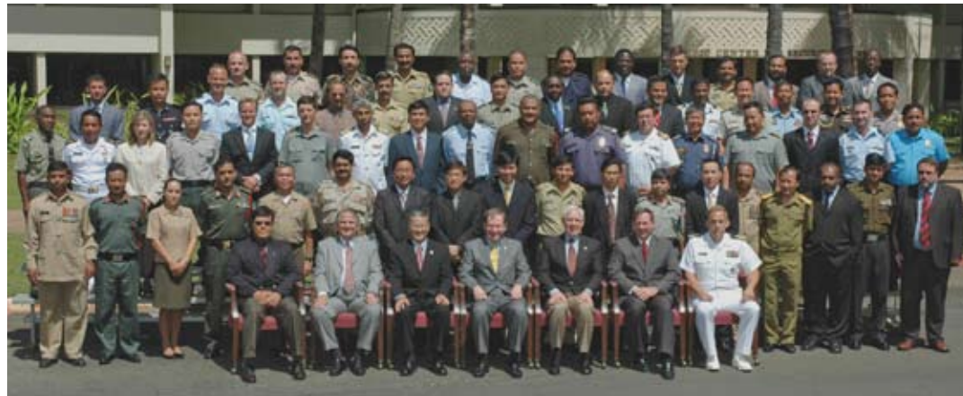
Sixty-two Fellows graduated from CSRT08-1 on March 26.

In addition to coming to understand the importance of networking and cooperation in combating acts of terror in the Asia Pacific region, participants in the program gained a comprehensive and multidimensional understanding of terrorism as a whole that many found useful for inspiring more effective courses of action that can be taken in the future. A participant reported, "I feel that I have a more complete understanding of the complexities of combating terrorism. I thought that this was just a religious war, but I now know that it is more than that. There are issues of economic, education, and political implications. I feel like I have a widening of my understanding about terrorist ideologies and their struggles." Another participant in the program asserted, "The course has changed my view on the importance of understanding, assessing, and developing courses of action to counter terrorism."