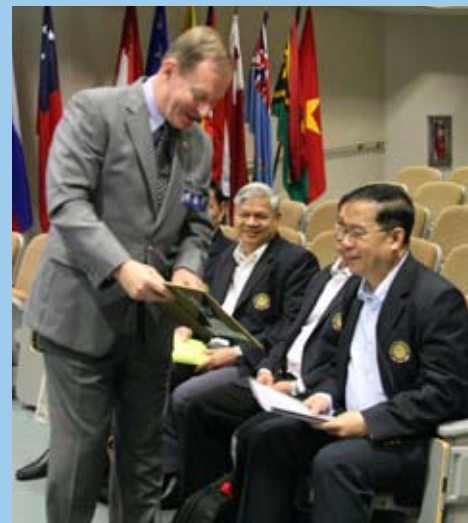
LtGen Sirapong Boonpat; Secretary-General of the National Security Council (Thailand) and eight delegates visited the Center in January to discuss national disaster management issues.