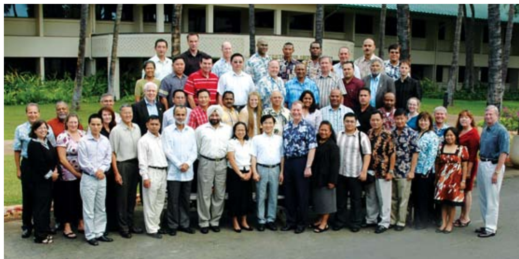
Alumni Association Leadership Workshop