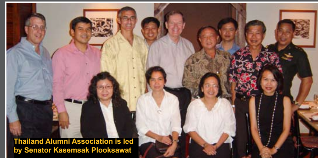
Thailand Alumni Association is led by Senator Kasemsak Plooksawat