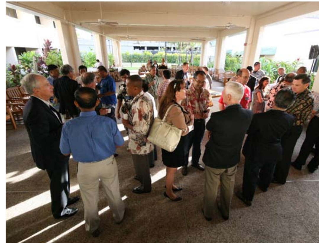
Foundation members. Faculty and Fellows meet during a reception after the annual APCSS Foundation meeting.