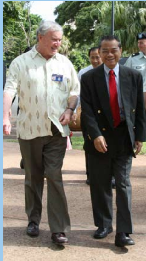
Amb. Charlie Salmon hosts Minister Soubank Srithirath of Laos on a visit to the Center.