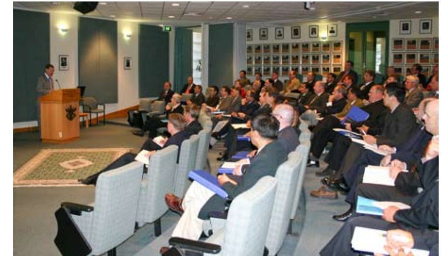
The Australian Homeland Security Centre and the newly forming Asia-Pacific Centre for Civil-Military Cooperation (APCCMC) welcomed engagement with APCSS. These institutes are designed to help Australia better align public (civilian and military) with private-sector assets. Getting government and non-government officials to cooperate in the complex security environment is a common goal shared by APCSS.