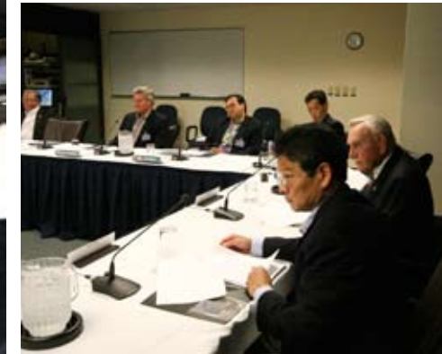
Foundation members receiving an APCSS update at their annual meeting.