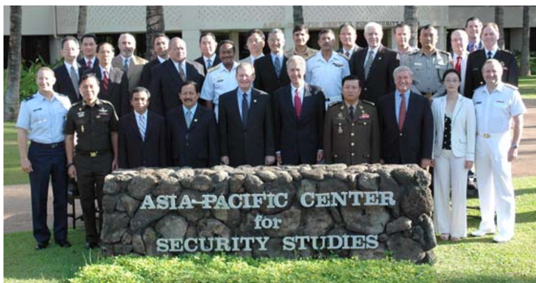
TSC08-2 was held June 16-20, 2008 with 24 Fellows attending.