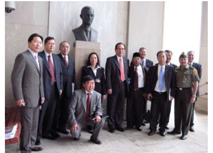
Indonesian and Mongolian Parliamentarians visit the Pentagon during a recent trip to Washington D.C. where they also met with key members of the U.S. Congress and U.S. Department of State.

According to participants, the Honolulu phase provided an invaluable preparatory foundation for the Washington, D.C. visit. The time at APCSS allowed them to systematize and organize their thoughts on the security sector in Indonesia and Mongolia. Further, as one participant observed, “by analyzing the weaknesses