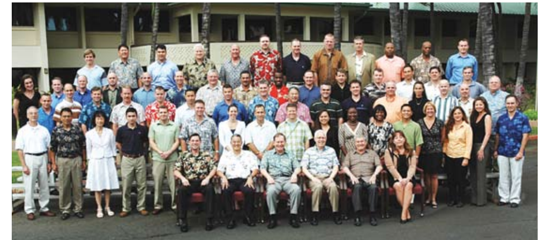
APOC08-1 was held January 14-18, 2008

international Fellows from other APCSS courses.