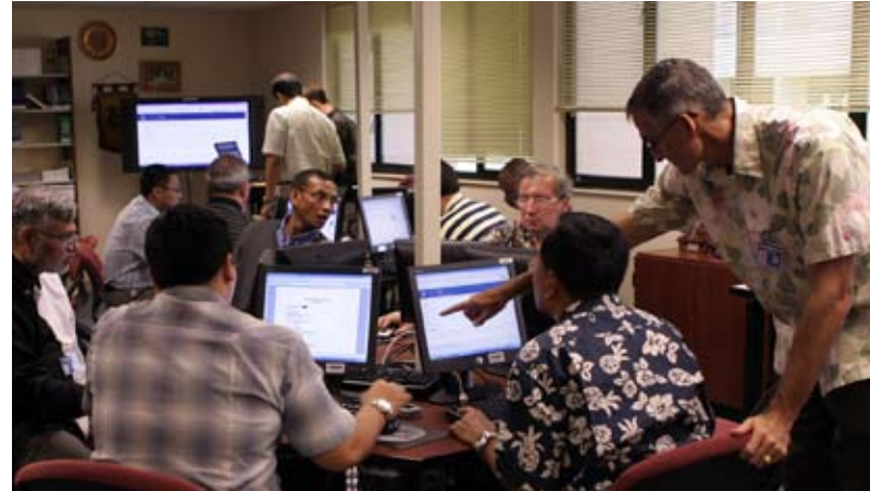
Alumni Association leaders get familiarized with APCSSLink.

Portals are being used to share information with Fellows while here and long after graduation.