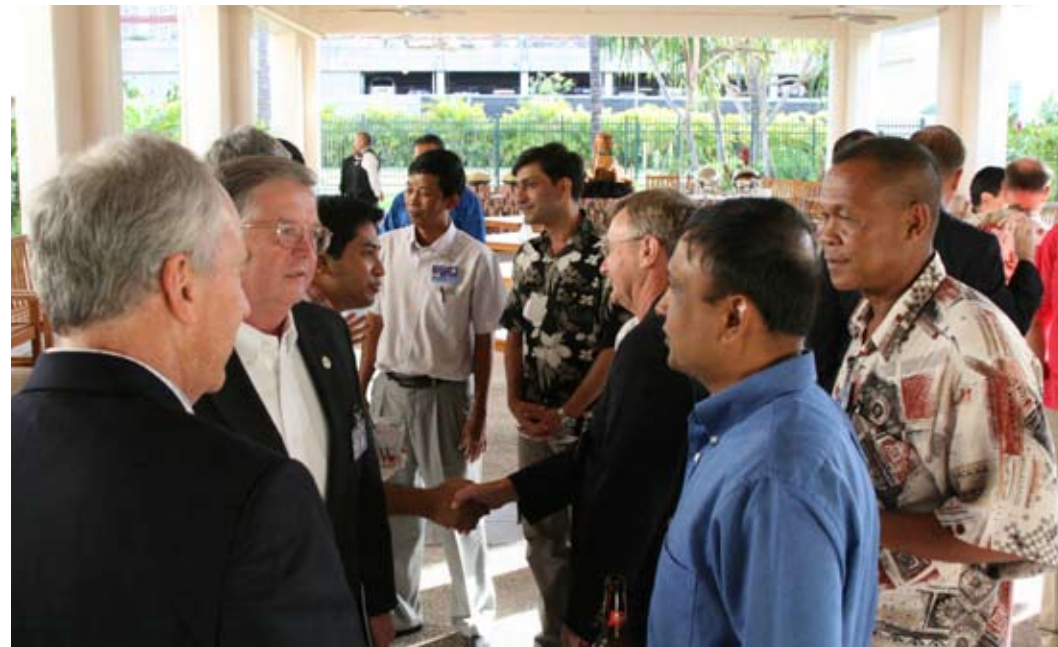
Foundation members meet with Fellows from ASC08-1.