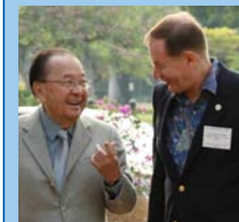
Senator Daniel Inouye