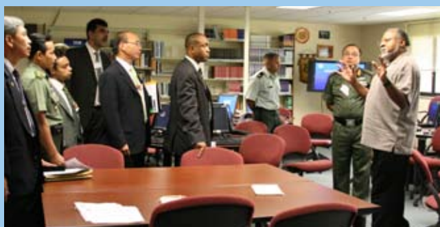
Fellows receiving a Library orientation