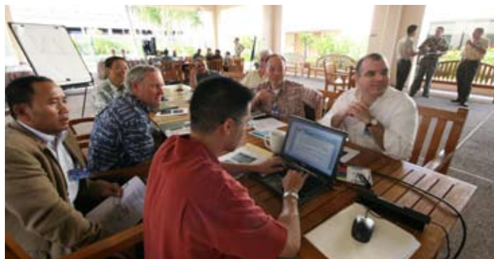
TSC08-1 Fellows work discuss solutions during an exercise on the Lanai.

Two classes of senior leaders completed the Transnational Security Cooperation course in recent months. The course is an intensive program for current and future senior regional influencers/leaders, military officers at the one- to four-star level, and their civilian equivalents from the Asia-Pacific Region, as well as Canada, Chile and Peru. Curriculum emphasizes the impact of current and future change in the region, as impacted by regional and global security threats. The course includes guest speakers, interactive seminar workshop scenarios addressing complicated transnational threats, and discussions with senior U.S. Pacific Command officials, all intended to share perspectives and further identify cooperative approaches to transnational security issues of common concern.