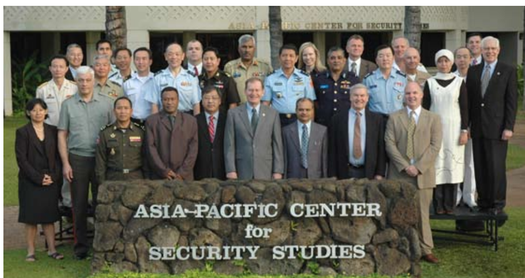
Twenty-four Fellows attended TSC08-1 which was held Jan. 28 - Feb. 1, 2008.