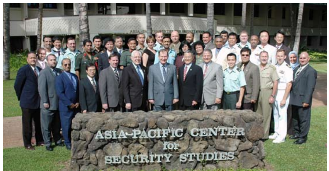
CSRT08-3 completed their studies in December 2008.