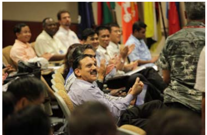
Fellows welcome participants of an exercise in negotiations.