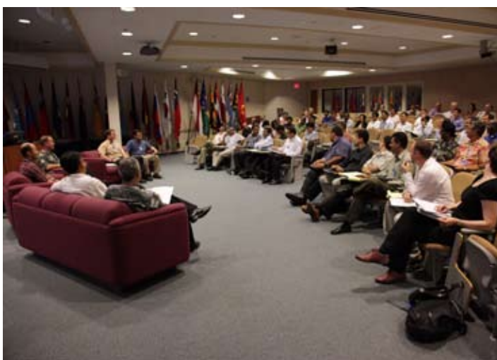
To prepare for an exercise on negotiations a new staging of sofa's to recreate a diplomatic meeting was created in the auditorium.