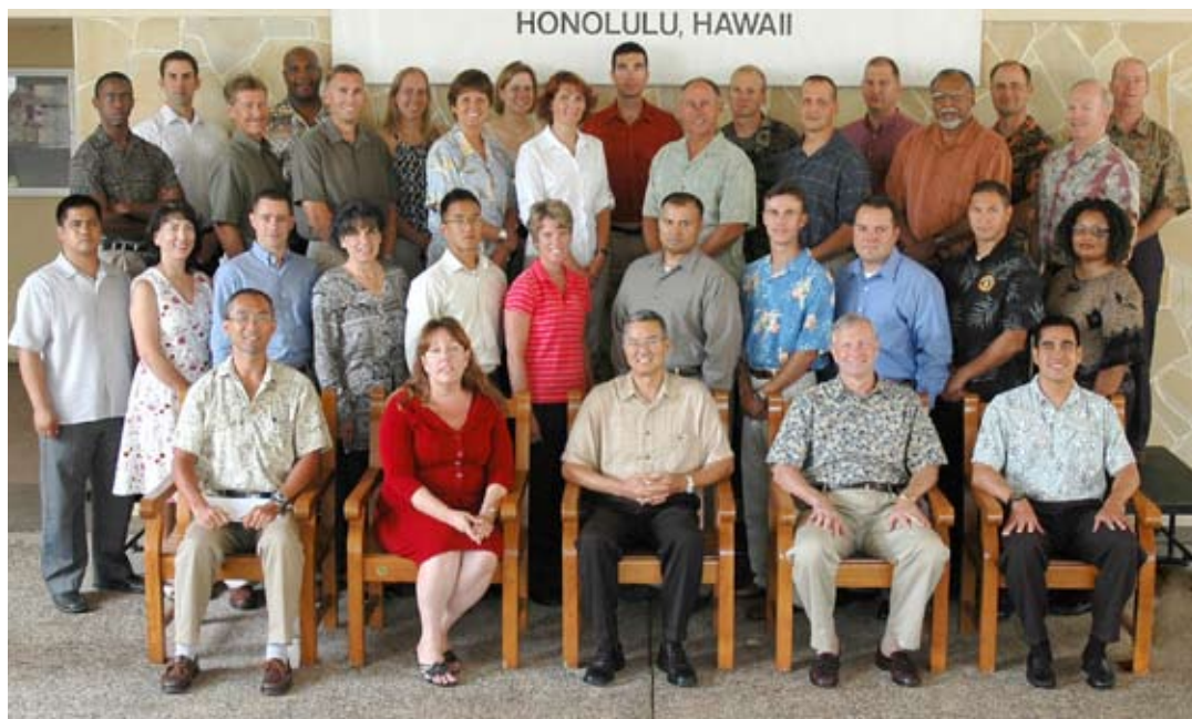
APOC 08-2 was a smaller variation of the course with 28 Fellows.

All (100%) of the Fellows stated they would “likely” or “highly likely” recommend the course to their colleagues. In general, the comments provided noted an increase in knowledge and networking opportunities. These opportunities will facilitate better job performance for personnel assigned to work in the Asia-Pacific region.