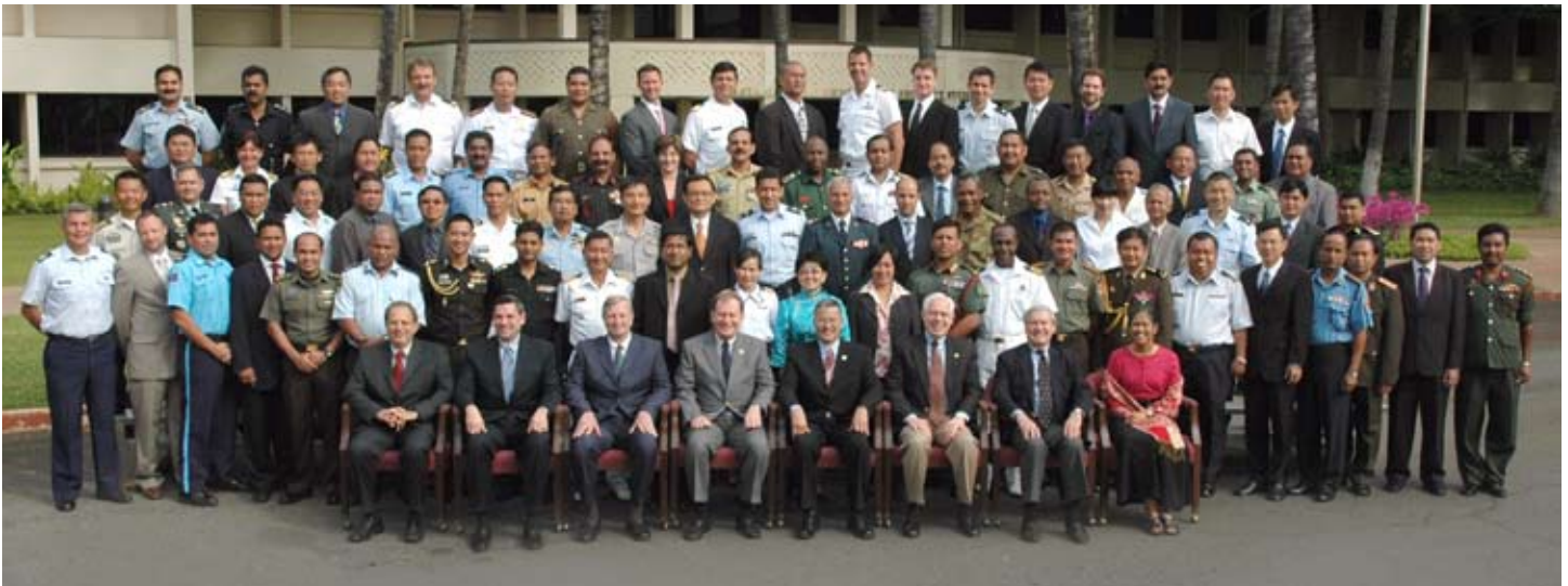
ASC09-1 included 79 Fellows representing 38 countries and territories. The course was held January 22 through March 11.