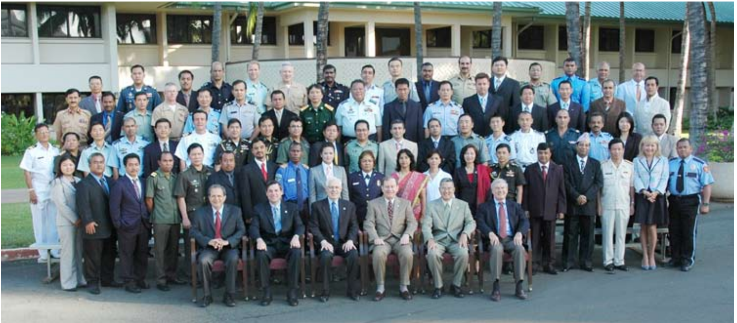
ASC08-2 graduated from on Sept. 19, 2008

Over the last few months two classes of the Advanced Security Cooperation course graduated from APCSS. The first course, ASC08-2, graduated in September 2008 with 72 senior military and civilian government leaders from 35 countries. The most recent course, ASC09-1, completed in March 2009 with 79 Fellows representing 38 countries.