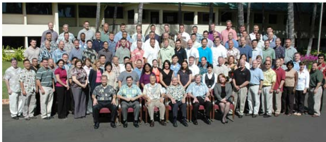
APOC 09-1 was held in January 2009 with 91 Fellows attending.