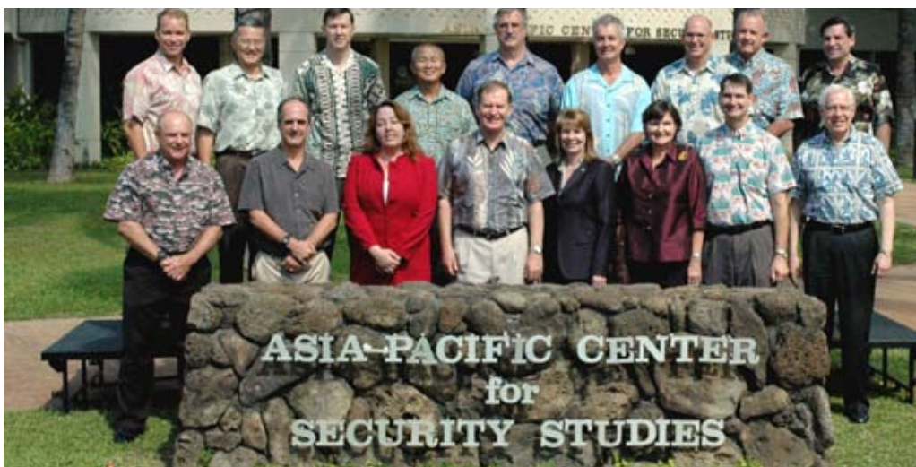
Fellows of the first Senior Executive Asia-Pacific Orientation Course held in January 2009.