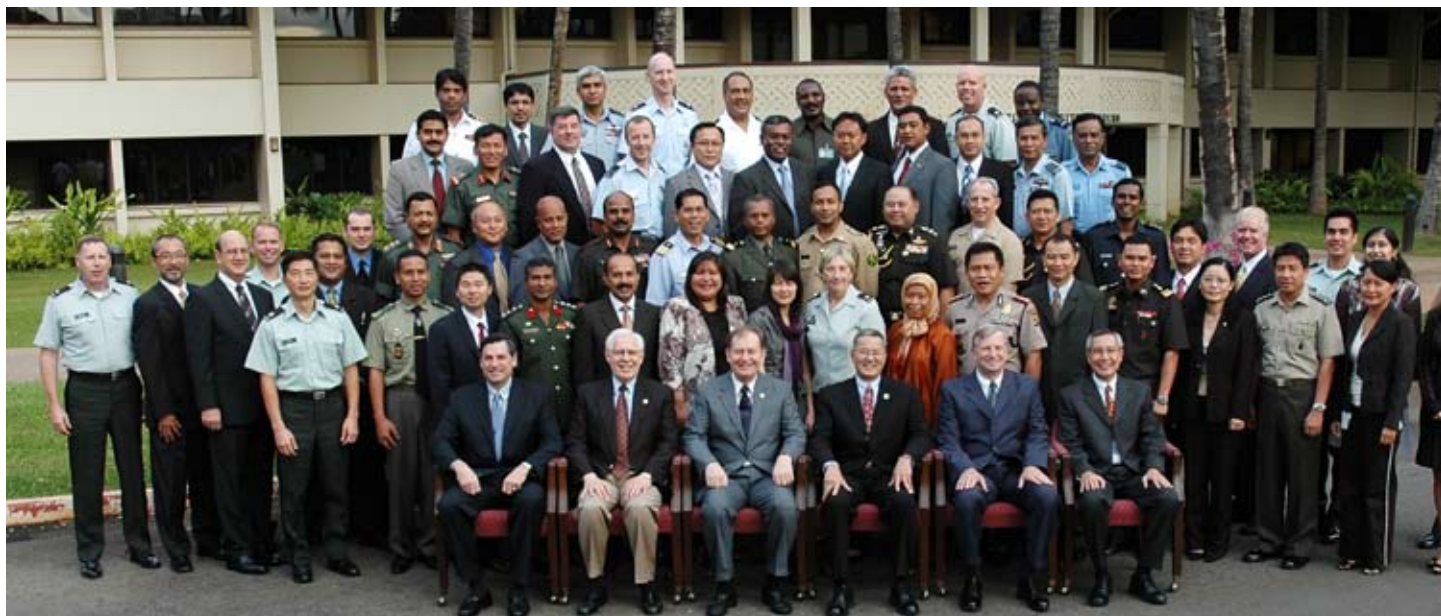
Fellows from CCM08-3 graduated in December 2008.

Forty-nine Fellows graduated December 18 from the “Comprehensive Crisis Response Management: Preventing, Preparing, and Responding Course” (CCM) in Honolulu. The Fellows represented military and civilian government leaders from 25 countries throughout the Asia-Pacific region and Africa who attended the four-week course to study regional collaborative approaches to crisis management.