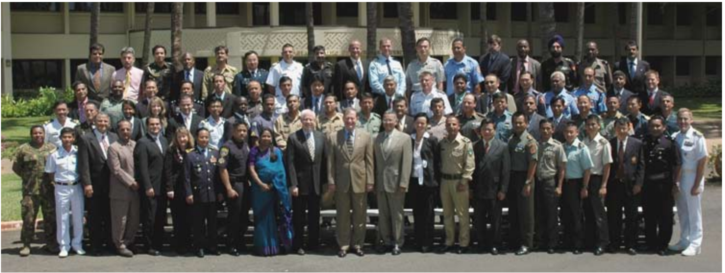
CSRT08-2 completed their course on June 27, 2008.

A total of 97 military and civilian participants from 41 countries throughout the Asia-Pacific region graduated from the Asia-Pacific Center for Security Studies' Comprehensive Security Responses to Terrorism CSRT08-2 and CSRT08-3 courses in Honolulu. Participating in the three-week CSRT course were representatives from American Samoa, Australia, Bangladesh, Bhutan, Cambodia, China, Colombia, Egypt, El Salvador, Guam, India, Indonesia, Iraq, Kazakhstan, Kenya, Laos, Lebanon, Malaysia, Maldives, Mauritius, Micronesia, Mongolia, Mozambique, Nepal, Pakistan, Palau, Papua New Guinea, Peru, Philippines, Poland, Republic of Korea, Saudi Arabia, Singapore, Solomon Islands, Sri Lanka, Switzerland, Tanzania, Thailand, United States and Vietnam.