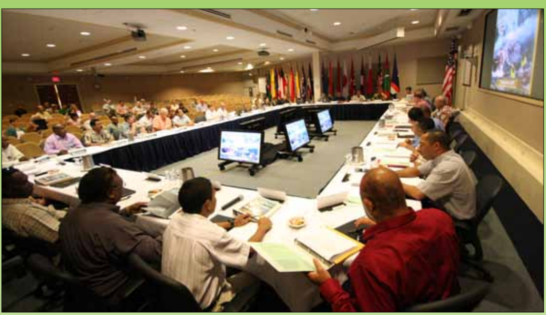
Another workshop in the Pacific Islands security series is tenatively scheduled for September 2012.

As a group they developed recommendations for next steps that regional govern-