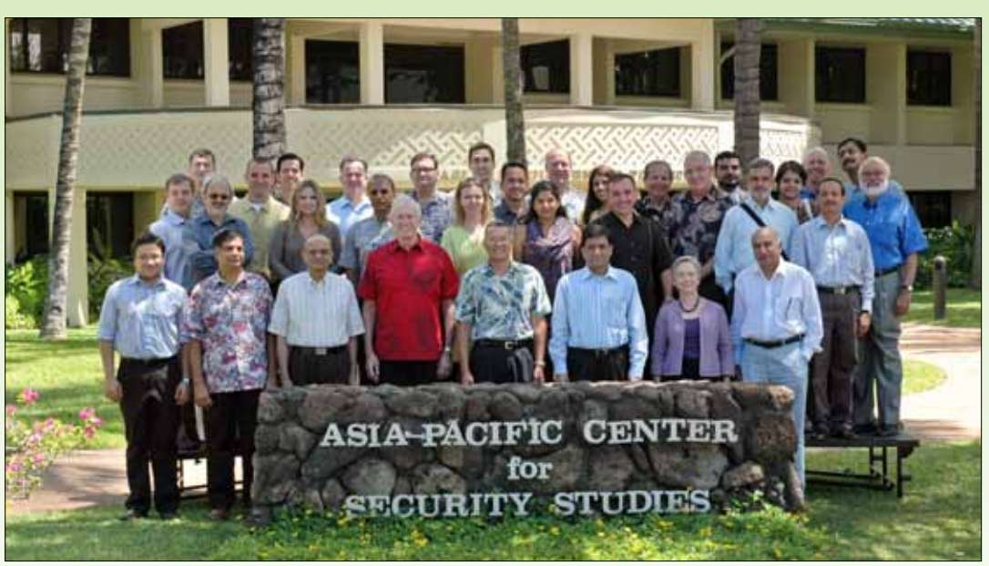
The workshop was attended by more than 25 participants representing sectors such as security, diplomacy, academics and the media.