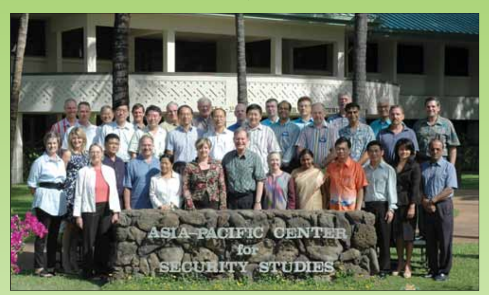
Science & Technology workshop attendees looked at gaps between S&T and security communities.