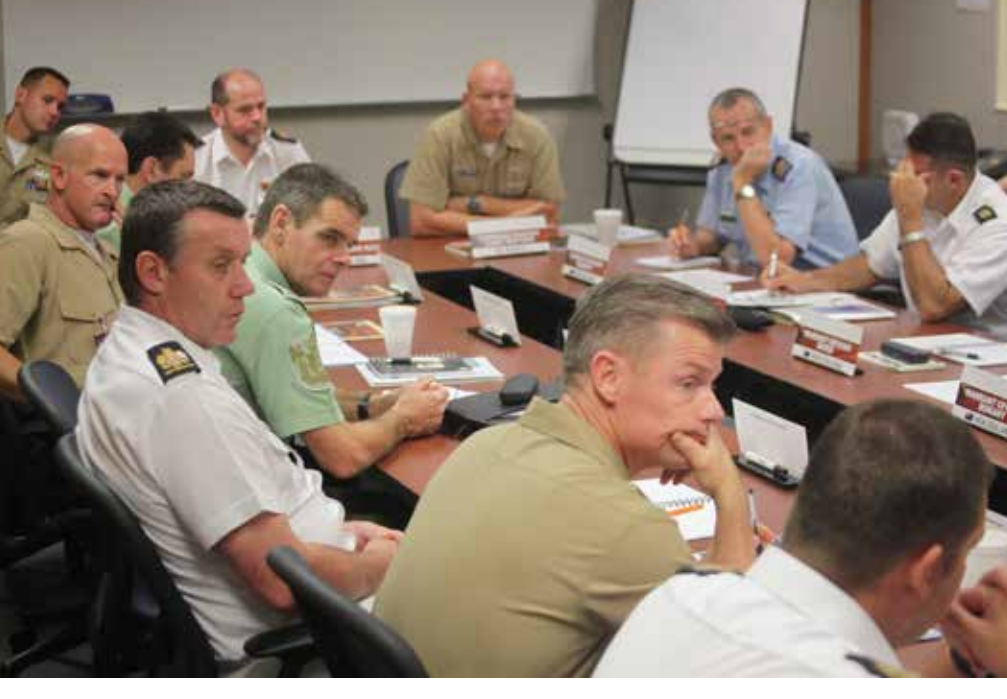
Fellows discuss transnational security trends and what strategies can be developed to respond to existing and emerging security challenges in the region.

An interagency delegation from the United States included representatives from the Department of Defense, the State Department, Joint Staff and U.S. Pacific Command.