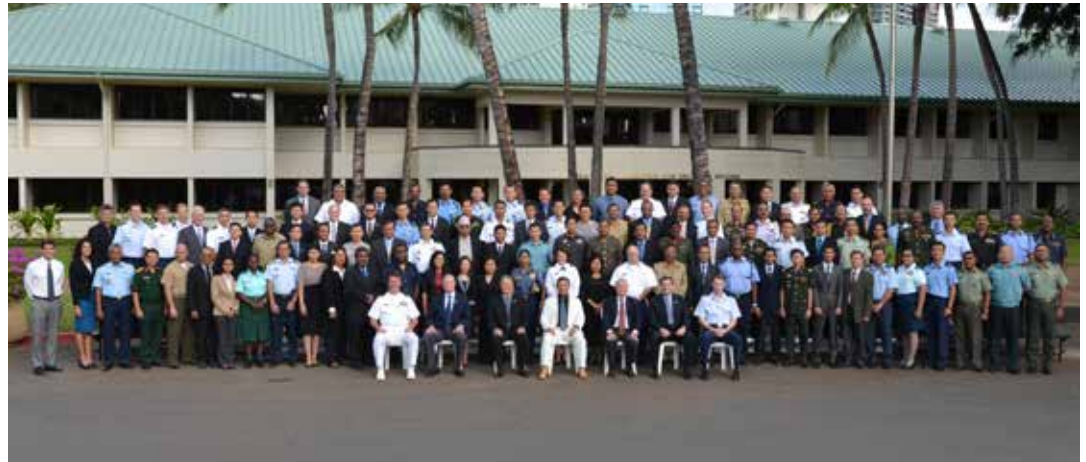
Ninety three military and civilian government leaders from 34 countries, territories and one international organization graduate from the Asia-Pacific Center for Security Studies Advanced Security Cooperation Course Oct. 31, 2012.

The four-week Executive Course focus is on building relationships among mid-