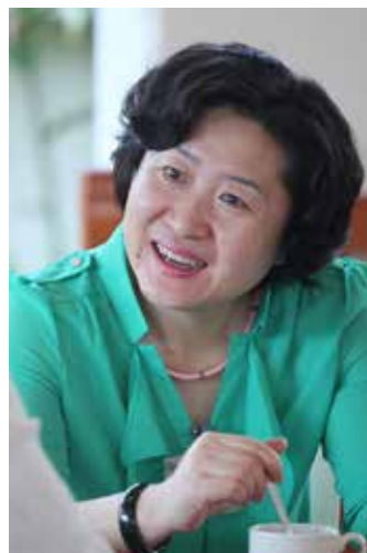
TSC Fellows get acquainted on the ACPSS Lanai.