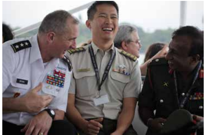
TSC Fellows get acquainted during a boat tour of Pearl Harbor.

Twenty-five senior executives from 24 locations completed the Transnational Security Cooperation (TSC) course December 7 at the Asia-Pacific Center for Security Studies in Honolulu. They included military and civilian leaders from Afghanistan, Australia,