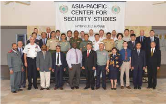
TSC 12-2 Fellows pose for their official group photo on the ACPSS Lanai.