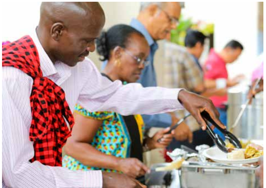
(clockwise from top left) CCM 12-1 Fellows “high five” each other after winning their volleyball game at the Bellow’s Team building event. CSRT 13-1 Fellows serve traditional foods from their respective country’s at Taste of Asia Pacific. An ASC 12-2 Fellow “heads” a pass to his team mate during a soccer game.