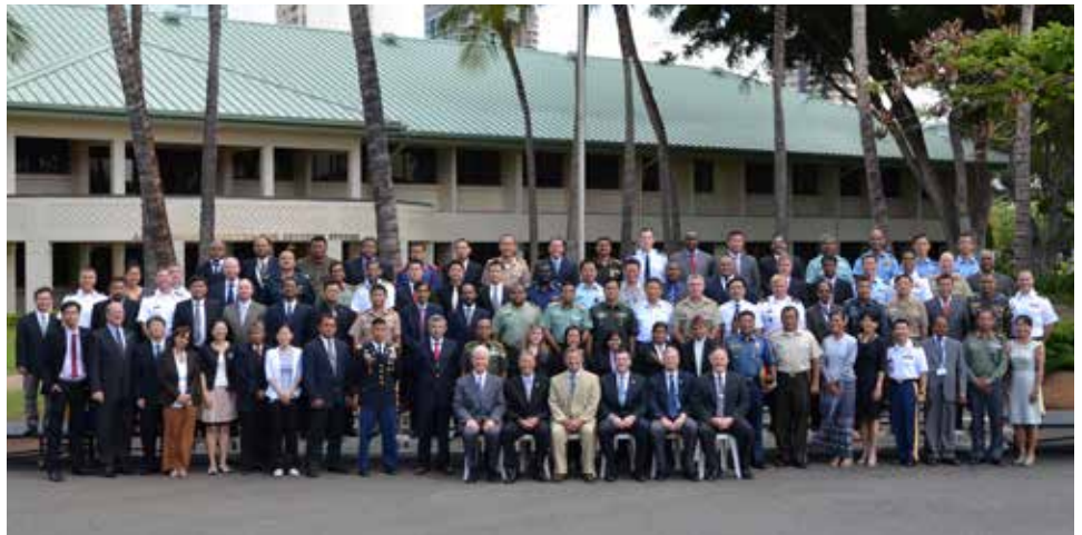
APCSS leadership, faculty and Fellows pose for a group photo in front of the Center.

Attending the regional security course were representatives from: Australia, Bangladesh, Bhutan, Cambodia, China, Fiji, Guatemala, India, Indonesia, Kiribati, Lebanon, Malaysia, Maldives, Mauritius, Micronesia, Mongolia, Nepal, Pakistan, Palau, Papua New Guinea, Philippines, Samoa, South Korea, Sri Lanka, Taiwan, Tanzania, Thailand, Tonga, Turkey, Tuvalu, United States and Vietnam.