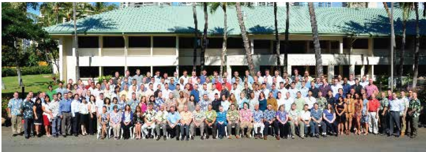
With 148 Fellows attending the APOC 13-1, it was the largest class in the history of APCSS.

In February, 148 American and international Fellows completed the popular one-week Asia-Pacific Orientation Course to become the largest class in APCSS history. Although the majority of Fellows were from U.S. Pacific Command and other on-island major component commands as well as the U.S. Coast Guard, USAID,