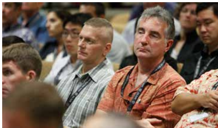
APOC 13-1 Fellows listening to a lecture in the Auditorium.