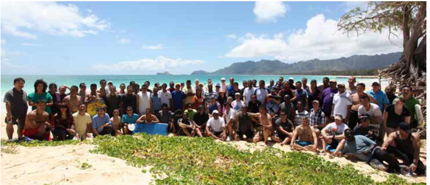
(clockwise from top left) CSRT 13-1 Fellows go for a “dig” during their volleyball match at Bellows AFB. ASC 12-1 Fellows from Indonesia show their traditional dolls to children at Taste of Asia Pacific. ASC 12-2 Fellows bond at the Hickam Par 3 Golf Course. CCM 12-1 Fellows on their way to an outing on the APCSS bus. CCM 12-1 Fellows pose for a group photo at the Team building event at Bellows AFB.