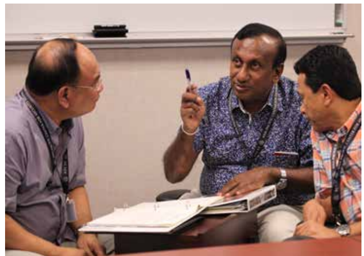
TSC Fellows brainstorming during a break-out session.

Bangladesh, Cambodia, Canada, China, Hong Kong, Indonesia, Japan, Malaysia, Maldives, Mongolia, Nepal,