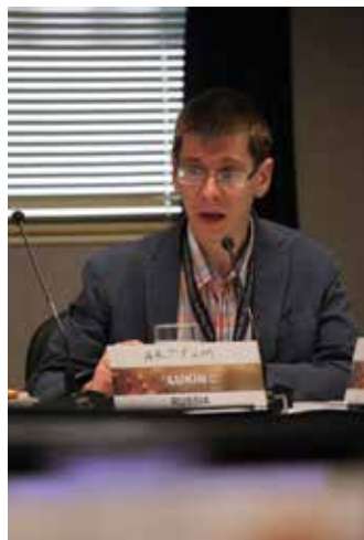
A TSC Fellow speaks to the group during plenary.

The course is an intensive program for current and future senior regional influencers/leaders; military officers at the one-to-four-star levels, as well as their civilian equivalents from the Asia-Pacific region. The curriculum emphasizes the impact of current and future change in the region, as influenced by regional and global security challenges and opportunities. The course includes guest speakers, interactive seminar workshop scenarios addressing complicated transnational threats and discussions with senior U.S. Pacific Command officials, all intended to share perspectives and further identify cooperative approaches to transnational security issues of common concern.