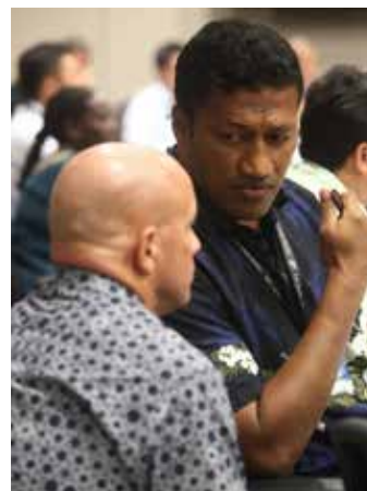
ASC Fellows discussing an issue in the Auditorium.