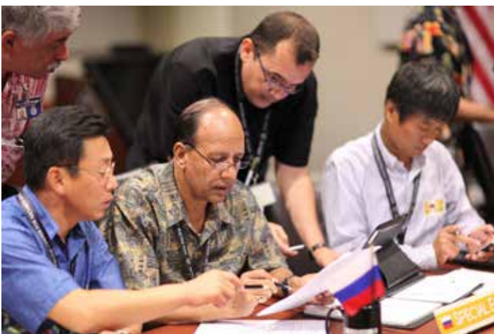
ASC 12-2 Fellows work as a team to solve a problem during one of their exercises.