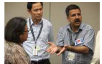
Lively debate is common in ASC.