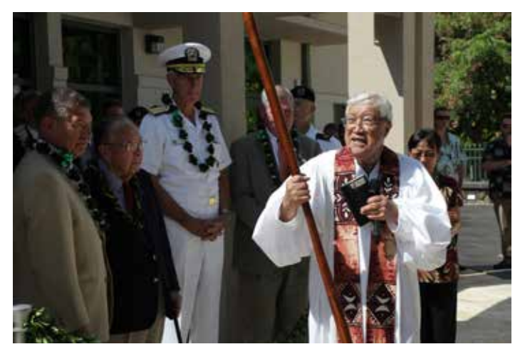
Kahu blesses the Center and Maluhia Hall.