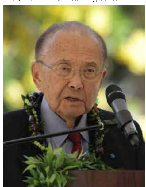
The late Sen. Daniel K. Inouye spoke at the ceremony.

The Asia-Pacific Center for Security Studies celebrated the official opening of Maluhia Hall, a new state-of-theart learning center in August 2012. The $11.4 million learning center