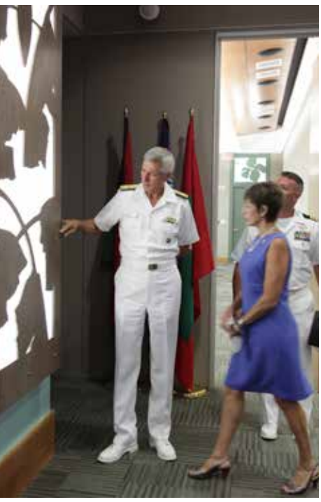
Admiral and Mrs. Locklear admire the decor of Maluhia Hall.

aspect: energy (over a 30% reduction in energy budget, incorporating a follow-on photo voltaic system), water (high efficiency fixtures), maintenance (lower impact on the environment), materials (renewable, sustainable, and recycled materials), and landscaping (xeriscaping, ethno-botanical garden with native and indigenous plants).