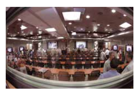
The new plenary room in Maluhia Hall.

Since 1995, nearly 15,000 course alumni and workshop participants from 104 countries have benefited