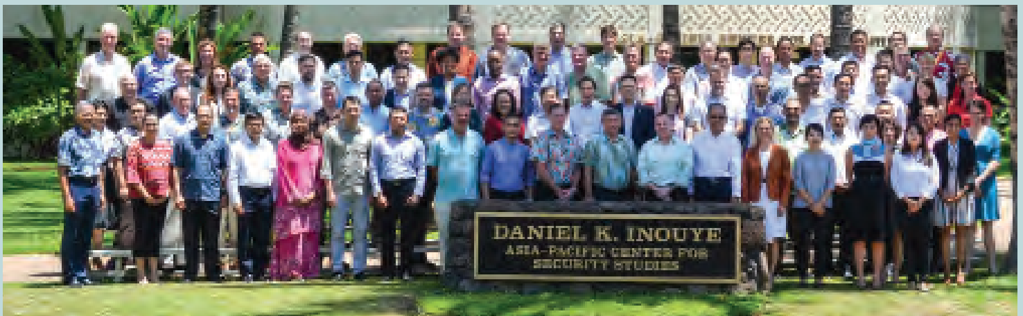
Security practitioners from nine ASEAN nations, the United States and Australia participated in the May “Building Maritime Shared Awareness in Southeast Asia II” workshop.

Participants for this second iteration hailed from Brunei, Cambodia, Indonesia, Malaysia, Myanmar, the Philippines, Singapore, Thailand, the United States, and Vietnam.