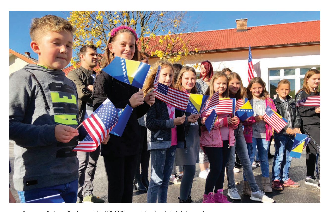
Every year, Embassy Sarajevo and the U.S. Military work together to help bring muchneeded repairs to schools in smaller communities throughout Bosnia and Herzegovina.