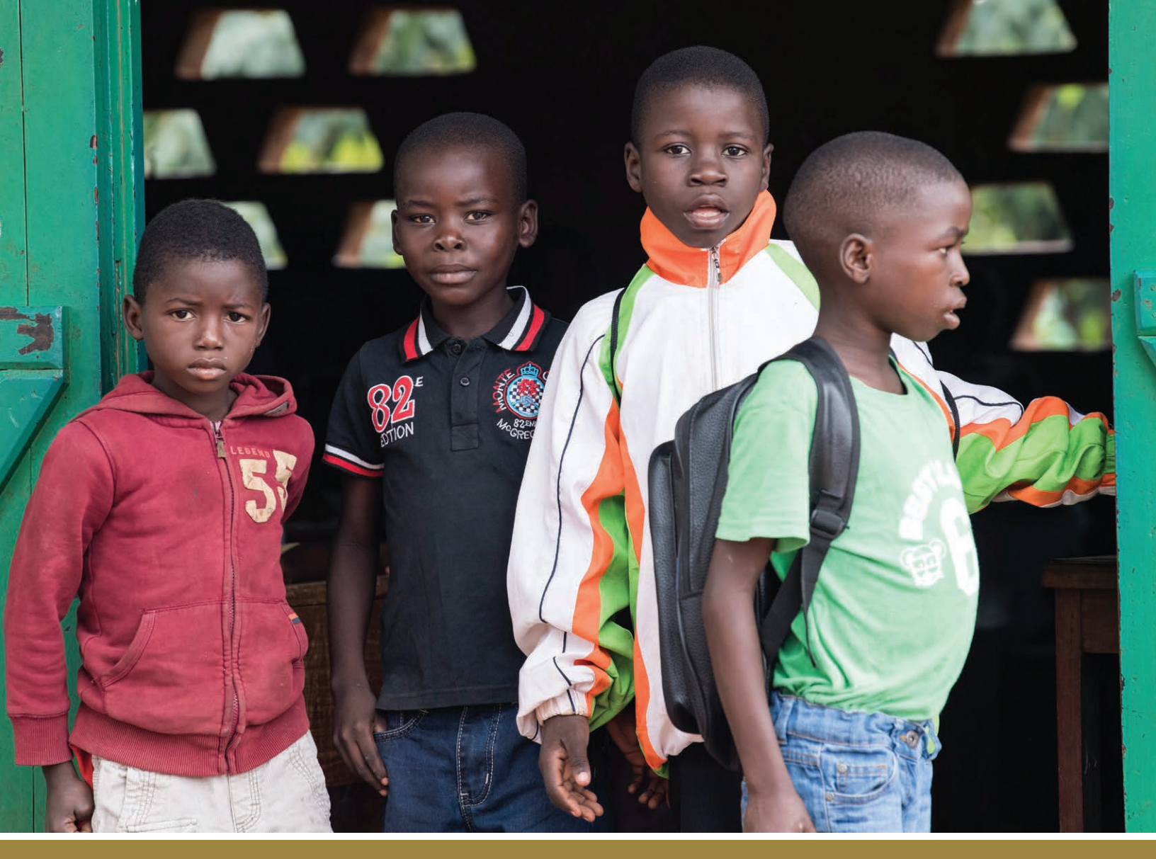
The Department plays an instrumental role in mobilizing new partners, including men and boys, to build support for women and girls' human rights. Boys leave a UN sensitization class in the Central African Republic.