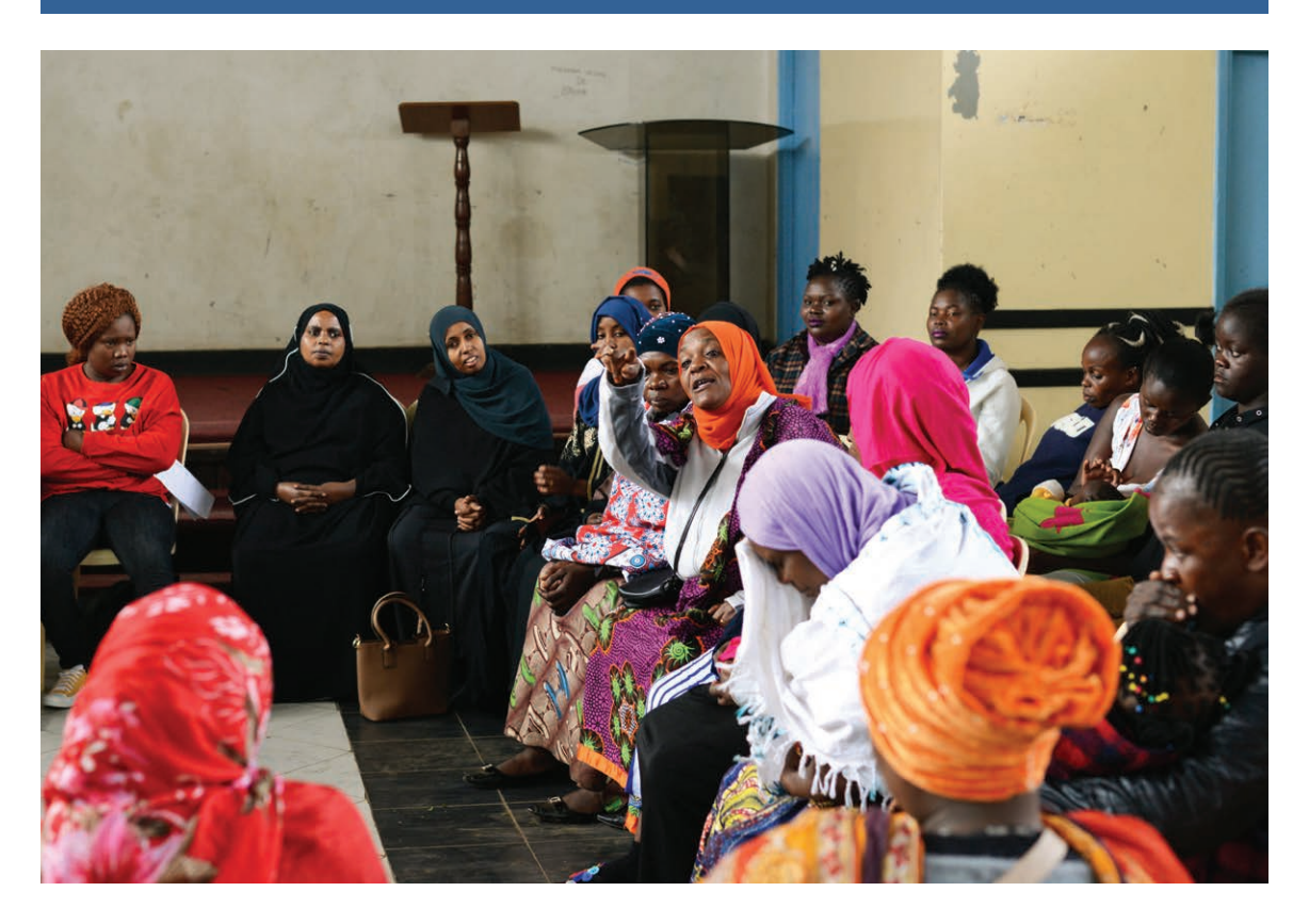
Kenyan women participate in a discussion on CVE through a program funded by the Secretary's Office of Global Women's Issues.

Listen, do not assume. When designing policies, programs, or operations, ask civil society and women leaders from different backgrounds what kind of support they need, and build this into your work. Be careful not to steal their ideas; women's contributions are already under-recognized. Building two-way relationships with local women leaders will help you, and them, navigate this balance. Follow their lead. At times, they may want visible support from a U.S. leader. At other times, this could endanger them. Indirect support might also be more appropriate, such as using diplomacy to amplify women's perspectives, or better yet, advocating for access to the table so they can speak for themselves.