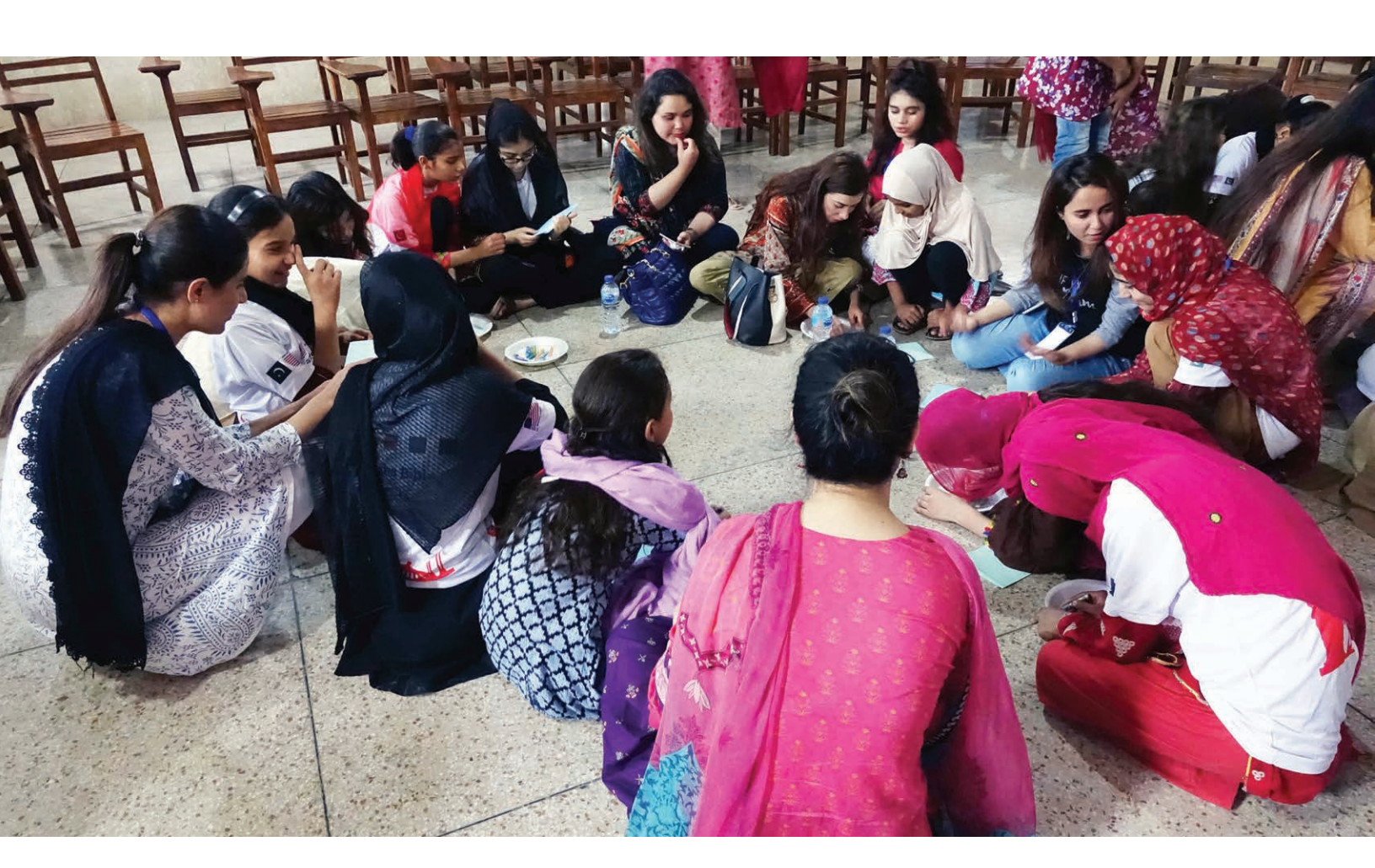
Women and girls participate in a workshop at the U.S. Embassy in Pakistan.