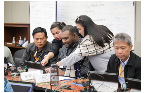
Fellows working together during seminar.

Workshops and Dialogues – DKI APCSS' tightly focused workshop and security dialogue program anticipates the most challenging regional and transnational security issues and cooperation tasks ahead. These events, in-person or virtual, serve as a forum for key regional interagency security policy drafters and decision makers to produce actionable outputs and executable outcomes, resulting in unique value-added opportunities to partnering organizations and participants.