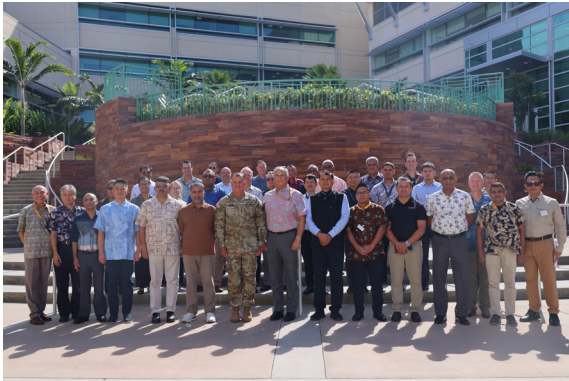
TSC Fellows at US Army Pacific Headquarters.