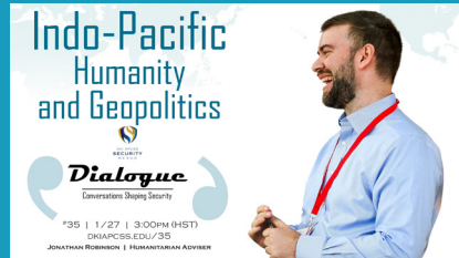
Dialogue #35 | Indo-Pacific Humanity & Geopolitics