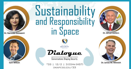
Dialogue #33 | Sustainability and Responsibility in Space